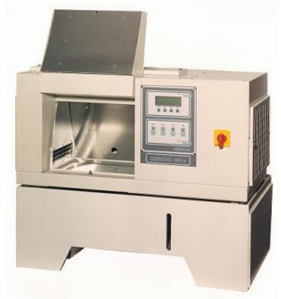
SOLARBOX 1500 E with FLOODING

PVC and corrosion-resistant materials ensure long life of this tank pump system: capacity up to 50 litres.