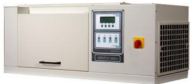
SOLARBOX 3000 E

Consequently, because the temperature produces an accelerated ageing, it is essential to be able to control of B.S.T. during exposure to filtered Xenon radiation.