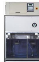
SOLARBOX R.H. with Humidity Control

We reserve the right to make changes to equipment and systems in response to advances in technology and modify parameter values accordingly.