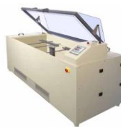
Horizontal Salt spray chambers.