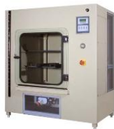
Vertical Salt spray chambers.