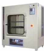
Corrosionbox 400 I