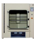
Corrosionbox 1000 I