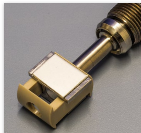
magnetic positioning system for solids